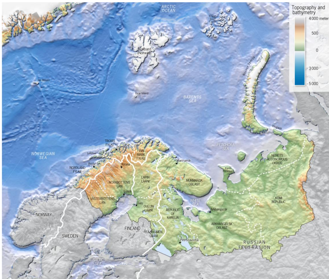
Barents Region, topography and bathymetry

The topography of an area can also mean the surface shape and features themselves.